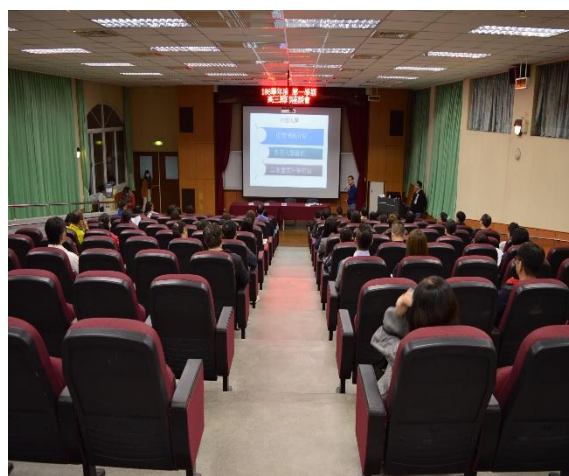
Seminar of Multiple JCEE Program