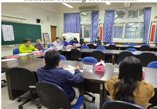
Further Education for Teachers