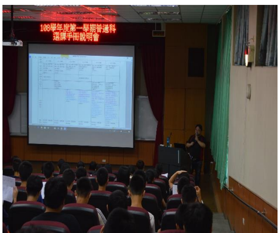
Seminar of Curriculum Guidelines of 12-Year Basic Education