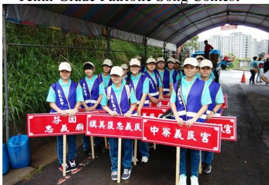
Volunteer Service of Hakka Yiming Festival