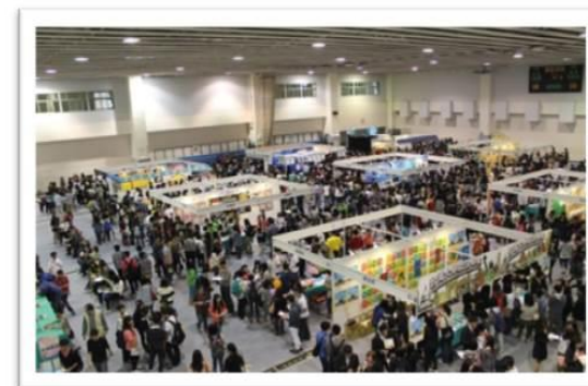
NTU Azalea Festival Visit