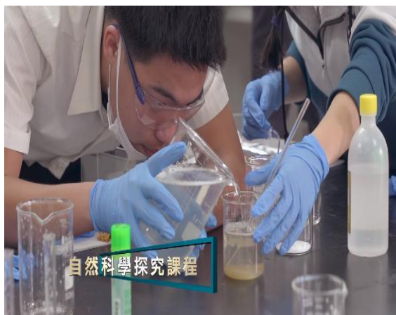
Natural Sciences: Inquiry and Practice