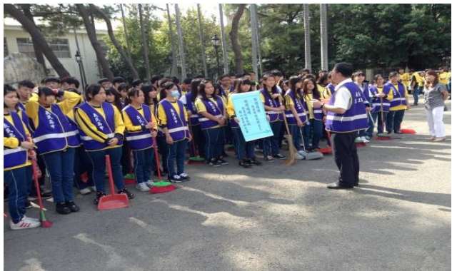
Principal Leading Volunteers to Participate in Community Clean-up