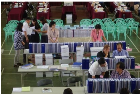
School Affairs Evaluation