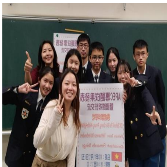
International Video Conference- Project-Based Learning with partner school: Vietnamese/ IGC Binh DUONG Primary- Middle-High School