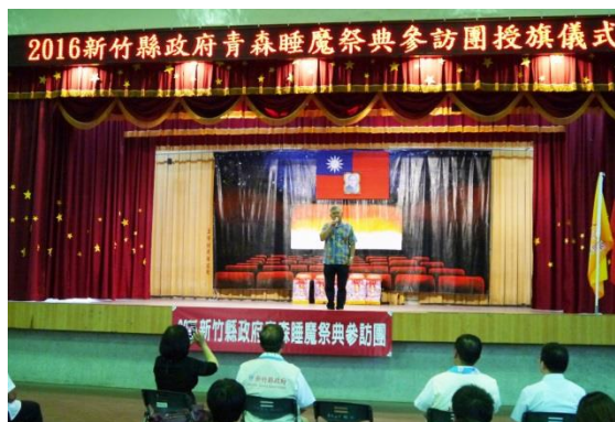
International Exchange with Japan