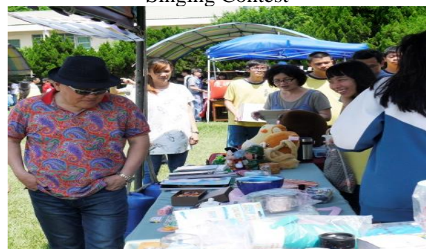
School Anniversary Celebration Fair