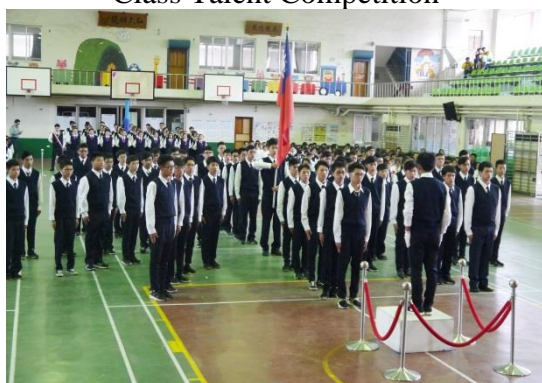
Tenth-Grade Patriotic Song Contest