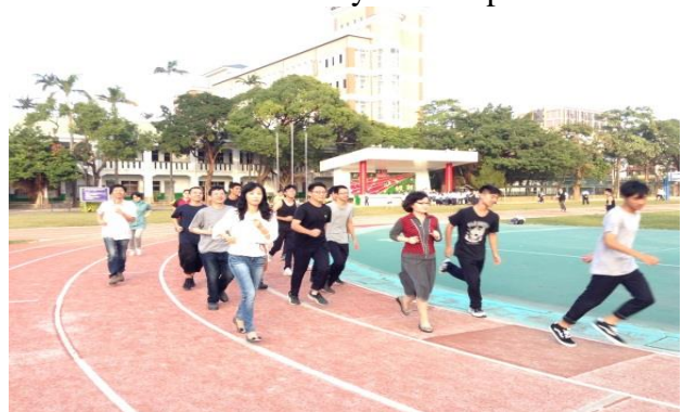
After-school Running by Faculty, Staff and Students