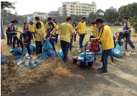
Volunteer Team in Action – Learning by Doing