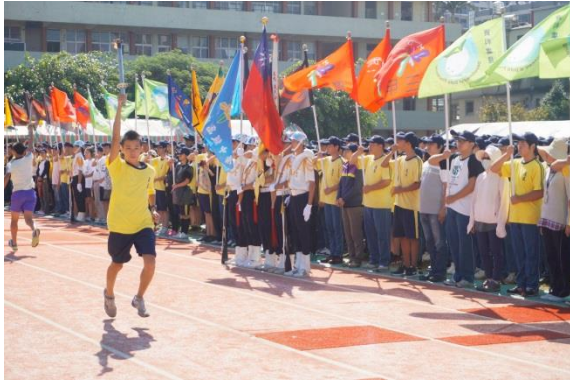
Sports Day Flame Entering the School