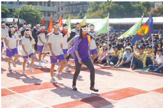
Creative Entrance on Sports Day