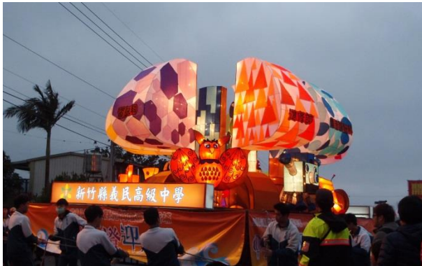
Xinpu Lantern Stroll