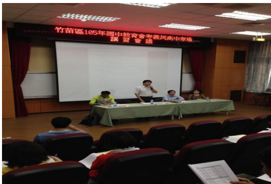
Seminar of High School Education Examination for Hsinchu and Miaoli