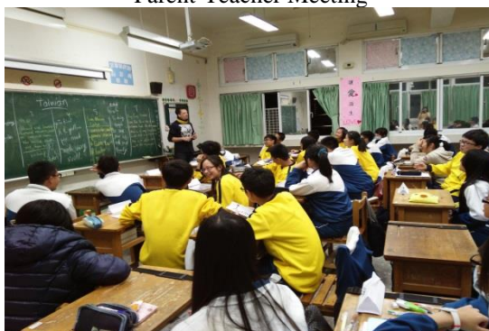
Collaborative Teaching By Foreign Teachers