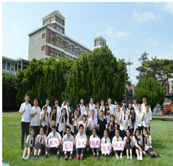
Admission to Top University in JCEE