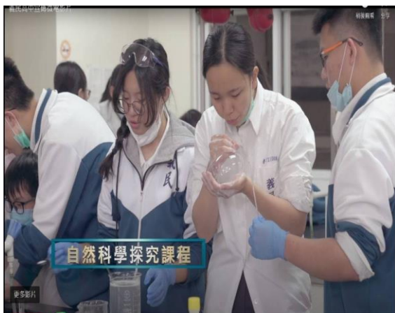
Natural Sciences: Inquiry and Practice