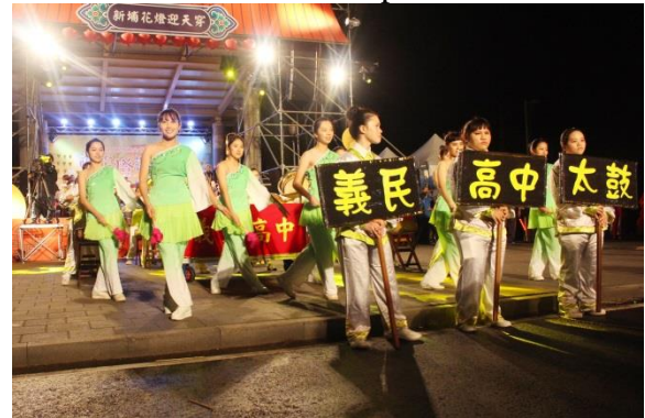
Xinpu Lantern Stroll