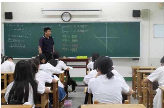
Remedial Teaching of Mathematics