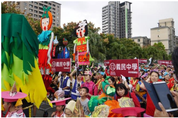
International Flower Drum Art Festival