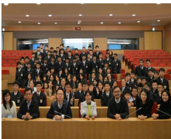
Academic Exchange with Mackay Medical College