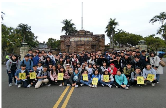
NTU Azalea Festival Visit