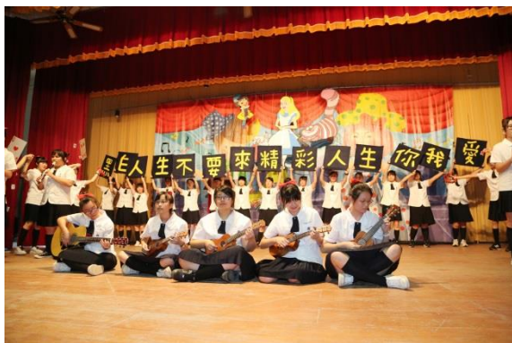
Class Talent Competition