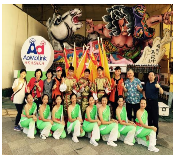
Represented Hsinchu County to Participate in the Aomori Nebuta Matsuri