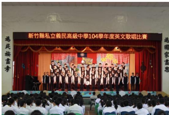
English Song Contest