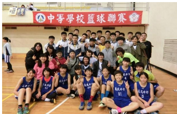
The Basketball Team Participated in the Secondary School Basketball League