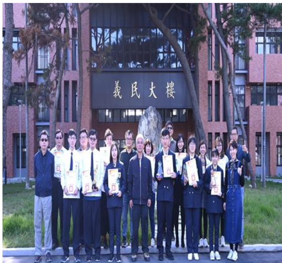
Golden Hand Award of National Skills Competition