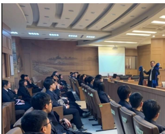
Field Trip in Taiwan Hinchu District Court