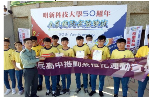
Won the Second Prize for the National Defense Armed Forces Competition