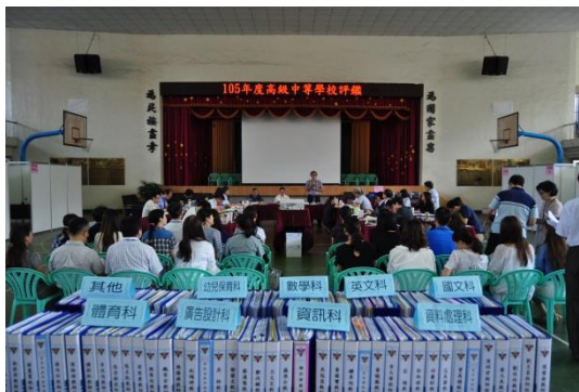
School Affairs Evaluation