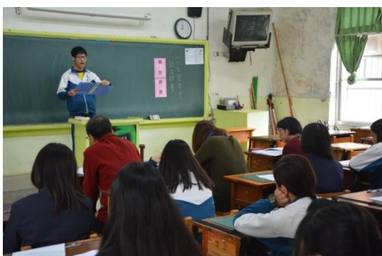
Chinese Language Competition