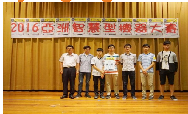
Participation in the Asian Intelligent Robot Competition