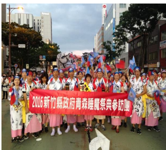
Represented Hsinchu County to Participate in the Aomori Nebuta Matsuri