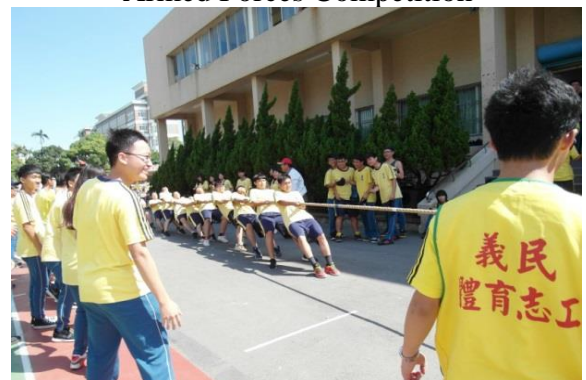
Tug of War Competition